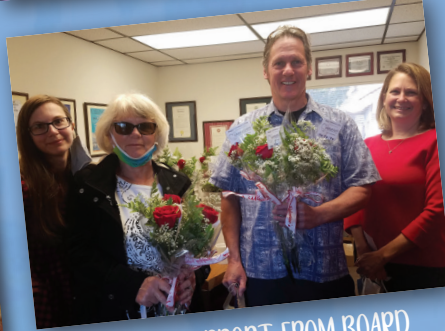
TONS OF SUPPORT FROM BOARD MEMBERS & THE OFFICE TEAM