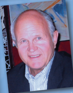
DEMENTIA-FRIENDLY RELIEF VOLUNTEERS