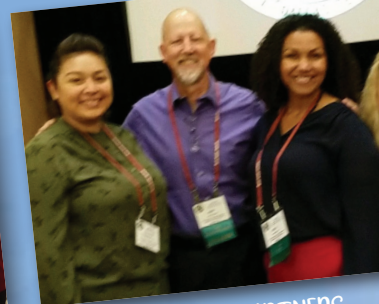
150+ COMMUNITY PARTNERS

* THANKS TO THE SENIORS CRAFT SHOPPE OF VENTURA FOR GIFTING HOMEMADE MASKS FOR OUR VOLUNTEERS