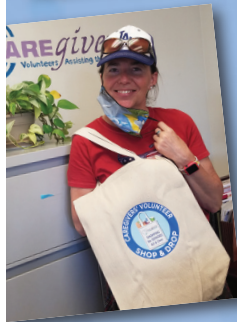
SHOP & DROP